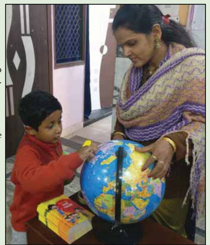
Learning outcomes for children still remain the biggest challenge for the SMC members.

The Common Cause team visited Trilokpuri as part of its commitment to make regulations laid down by the RTE Act more accessible to SMC members. We wanted to simplify various norms and standards provided by the Act that may be too complex an area to navigate for certain individuals. The meeting, which took place on December 22, 2018, included a discussion with SMC members of Trilokpuri's Block 32 around issues they face while monitoring school functioning. This was followed by the distribution of the Common Cause SMC booklet, which presents the powers, duties and responsibilities of SMC members as provided for in the RTE Act, 2009. The event ended with suggestions on how both SMC and Non-SMC members could contribute further towards school oversight and learning outcomes. Some of the suggestions included collaborative efforts with school administration and organising summer school programmes, among other things.