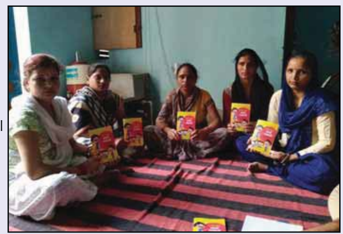
SMC members in Saboli Village helped install lights at school gates for late evening shifts.

The SMC booklet distribution in Saboli Village in Gokulpuri was done in association with NGO Samarthya, which works with about 12 SMCs in north east Delhi. Held on August 17, 2018, the meeting saw the participation of around a dozen people. Small milestones in their achievement trajectory included installation of lights at school gates for late evening shifts, ensuring punctuality of teachers and posting of guards at school gates.