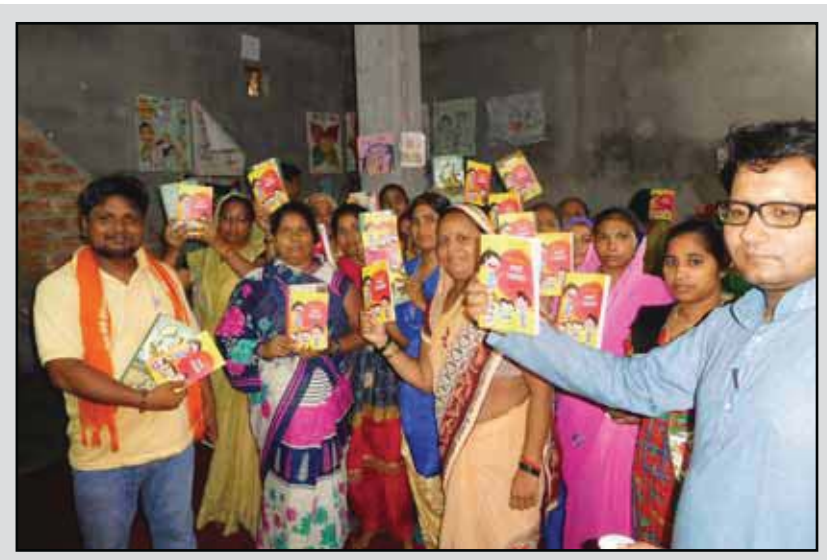
Members of the elected bodies said they needed to speak up about their challenges.