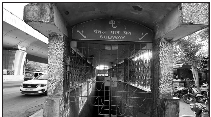
Figure 2: A Subway in Delhi

In 2023, there was an incident in Delhi in which an IIT student died and another was injured in a road accident as the subway near IIT is closed after 10 pm. Following this, Delhi Minister