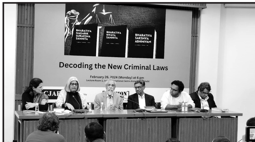
Justice Madan B. Lokur, former SC judge, at the event

Common Cause, in partnership with the Campaign for Judicial Accountability and Reforms, (CJAR) organised a panel discussion on 'Decoding the Three Criminal Laws' on 26th February 2024. The idea was to discuss and analyse the newly introduced laws whose stated purpose is to decolonise the Indian justice system and ensure time-bound completion of trials. The new laws will replace the IPC (Bharatiya Nyaya Sanhita) CrPC (Bharatiya Nagarik Suraksha Sanhita) and the Indian Evidence Act (Bharatiya Sakshya Adhinyam).