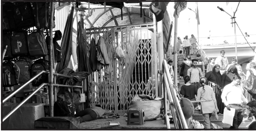
A Malfunctioning Escalator at a Foot-Over Bridge at New Delhi's Anand Vihar ISBT, Metro Station and Railway Station.

pedestrians avoid using FOBs. As is the case, the elderly, children, sick, differently abled, pregnant women and pedestrians carrying numerous items and bags don't prefer FOBs. Climbing and descending stairs are more of a hardship than a facility, devoid of ramps or electronic escalators. The dependence of escalators on electricity leads to irregular maintenance, and consequently, reduced utilisation.